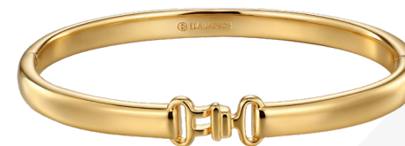
Buckle Up Bracelet yellow gold