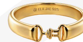
Buckle Up ring yellow gold